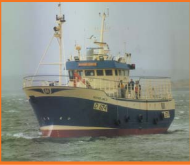
The MFV Heather Jane II and MFV Peadar Elaine II are the most recent vivier crab vessels to join the fleet.